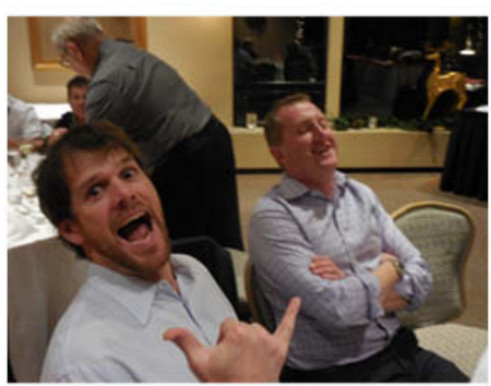
Christmas Party 2017 - O'Malley's on the Green